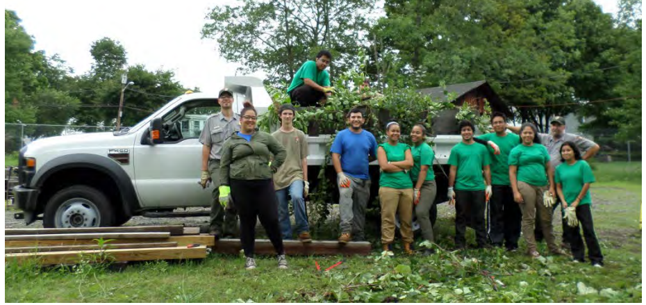
So Green comes together after a hard day of clearing invasive species